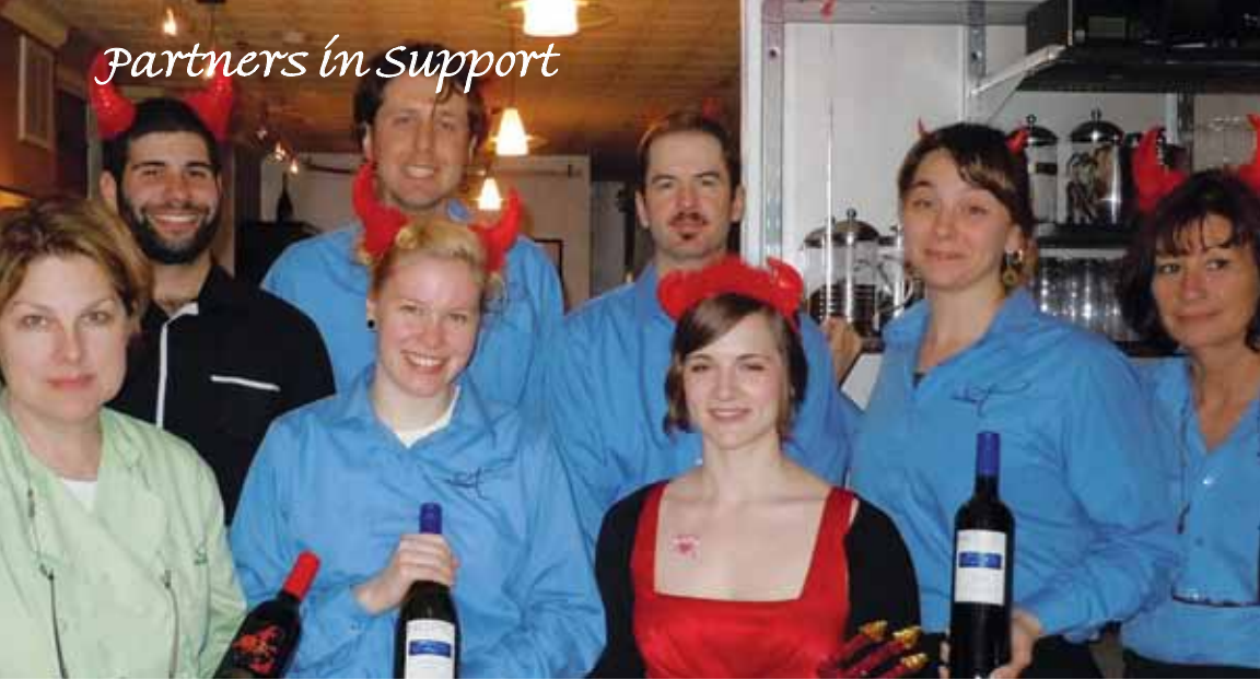
Alchemy Modern American Eatery team during 2011's Devilish Dinners in Hampden.

WE ARE INSPIRED DAILY by the profound impact our partners in support allow us to make on the quality of life for so many in our community. Without the compassion and commitment of the 40 hospitals in our network, the scores of services providers, our 2,100 donors, and 167 volunteers, the little and big things which can make a breast cancer patient's life a little brighter in the middle of great stress would not have been possible.