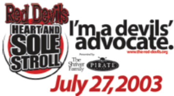
Inaugural Stroll graphic